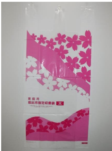
Sakaide City designated trash bag (burnable waste, unburnable waste)

You can buy the designated trash bags at supermarkets and convenience stores within the city.